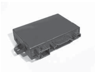
Example illustration for CAN-modules