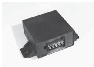
Example illustrations: signal strenghtening moduls