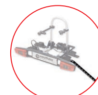
Wheel ramp Item no. 350020600001 Makes it easy to push bikes onto the holder