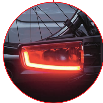
Modern LED lights (not bikelander classic)