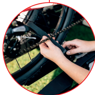
Long tensioning straps