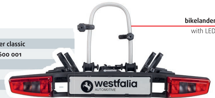
bikelander with LED