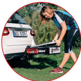
Compact folded size