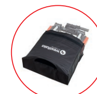
Protective bag Item no. 350013600001 For convenient and clean storage of the bicycle carrier

Subject to errors and changes. Issue 01/2018 - 892011 D