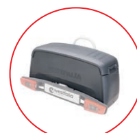
Transport box Item no. 350002600001 1170 × 600 × 425 mm (W×H×D) 200 l volume 45 kg max. load 15 kg empty weight Anthracite color