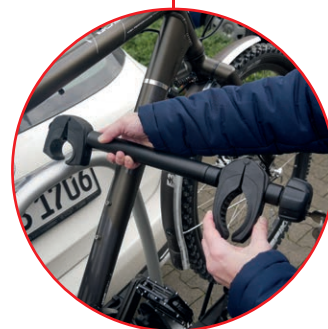
Flexible rubber-coated mounts