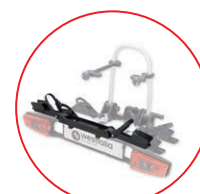
Extension for 3rd bike Screw-on Item no. 350014600001 20 kg max. load 3,5 kg empty weight Clickable Item no. 350055600001 20 kg max. load 5,5 kg empty weight