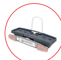
Transport platform Item no. 350004600001 1290 × 230 × 413 mm (W×H×D) 54 kg max. load 6 kg empty weight Anthracite color